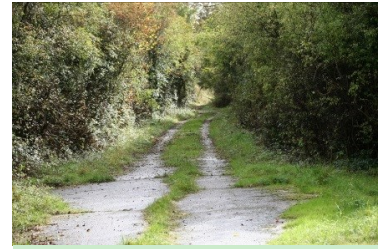
Entrance to Hutchinson's Bank

Hutchinson's Bank sits in a narrow, dry valley between New Addington and Featherbed Lane. It is a long, narrow strip, one kilometre by 250 metres in size, mainly chalk on the upper slopes and clay-with-flints along the valley bottom. Always poor farming land, over several centuries the main crop was rabbit meat and pelt. The landowner lived overlooking the Bank, the farmhouse on the site now occupied by Croydon's recycling and waste centre. Croydon Council had bought the estate in the 1930s. Most of Hutchinson's Bank was scheduled for the construction of 120 private houses and Farleigh Dean Crescent, the first eight, completed as World War 2 began.