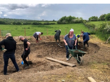
Volunteers from Fidelity at work