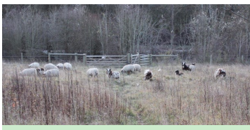
Beulah and Jacobs sheep on site