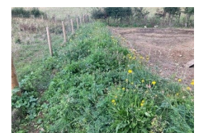
The new butterfly bank

The next step will be to carry out a little cosmetic work by hand to smooth the profile and ensure that it is perfectly level in all directions, after which it will be lined with sand before the main liner is installed. When complete the pond will be a haven for wildlife and provide another element for groups of people who visit. The increasing number of habitats at the farm will enhance the aspects of education with younger groups and continue to provide a rich experience to take away!