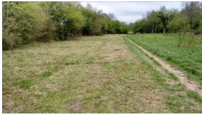
Entrance meadow - Farleigh Dean Crescent

After the war building did not resume and the valley became part of London's Green Belt. The Crescent, now a short cul de sac, is the road leading to a main access to Hutchinson's Bank.