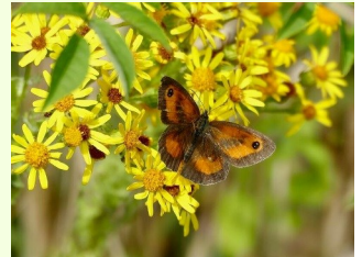
Gatekeeper on Ragwort, Hill Wood Field

Butterfly numbers were high in 1976 but crashed the following year - and to this day have never recovered to pre-1976 levels. The thinking is that the drought desiccated the larval food-plants, seriously affecting caterpillar survival. We will now have to wait to find out what the effect will be on butterflies in 2023; for instance, butterfly populations were relatively unaffected by the hot, dry summer in 2018. We will not know until monitoring begins next year but species whose larvae feed this autumn and winter are clearly the major concern.