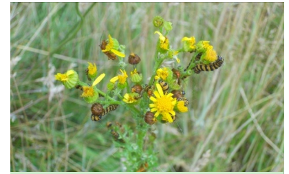
Cinnabar moth caterpillars

However, claims of mass livestock deaths aside, there is a complete other side to the story of this plant. It is a British wildflower of significant importance to many insects and therefore has a major role to play in maintaining a healthy biodiversity and balance of nature. It is estimated to support around 120 different species of invertebrate – more than any other wildflower. Of these, 30 species, some rare or scarce, rely entirely upon it for their existence, including 7 beetles, 12 flies, 7 micro moths and 1 macro moth (the black and yellow-banded cinnabar moth caterpillar that turns the toxin to its own advantage to deter predators). Any eradication of the plant would therefore prove to be fatal for these populations. It ranks as one of the most visited plants by butterflies, moths, bees and hoverflies – a major source of nectar for at least 30 species of solitary bee, 18 species of solitary wasp and 40 species of nocturnal moth.