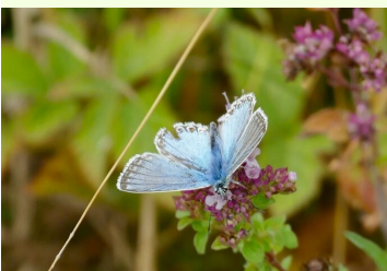
Chalkhill Blue on Marjoram

In June Dark Green Fritillaries had been the star butterfly of the year so far and this continued as they dispersed off the chalk. There has even been a first ever sighting at Headley Heath.