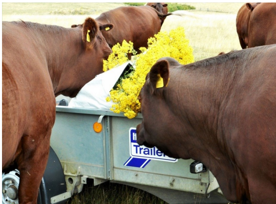
Inquisitive but not tempted

As a general rule animals will not touch it in its fresh and bitter form – I have seen many instances of horses standing in fields full of untouched ragwort – but, dried in hay, it loses its bitterness but not its toxicity. It is deemed to be of sufficient threat that under the Weeds Act 1959 the Secretary of State can serve an enforcement notice on the occupier of land on which ragwort is growing, requiring them to take action to prevent its spread. It is also illegal to fail to remove it from a field that is cut for hay. And the subsequent Ragwort Control Act 2003 promotes the more efficient control of ragwort where it is deemed a threat to animal welfare. However, whilst not doubting its potential dangers or the need to remove it from a hay crop, the 'science' upon which its impact is based quickly falls apart upon even the most cursory scrutiny.